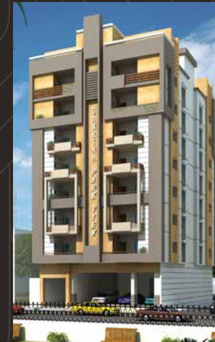
Samrina Park View